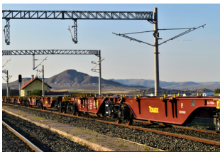
6 axle wagons Sggrss 80' and 90'

As a certified Entity in Charge of Maintenance, every year Touax Rail ensures the maintenance of more than 10 642 plateformes in Europe and UK, to make sure they always run safely along their in-service life-cycle.