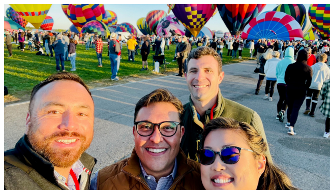
Touax Team at NPSA

It was a great occasion to thank all our partners that contributed to one of the record year of Touax Container in the resale and trading activity in North America.