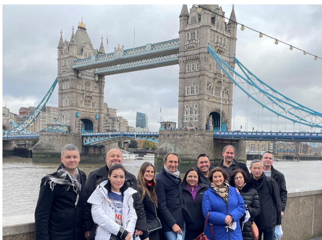
Touax Team at Tower Bridge

It was also the opportunity to share a visit of this beautiful city!