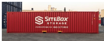
Customised storage unit

2021 saw increasing lease durations for new containers, in average at 12-13 years, and contractual extension of the existing fleet on life-cycle leases. Touax Container's average utilization rate over the period was at 99.6% thanks to these favorable market conditions and the valuable support from its customers.