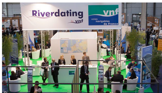
River Dating Exhibition

For more details, please visit the website: https://riverdating.vnf.fr