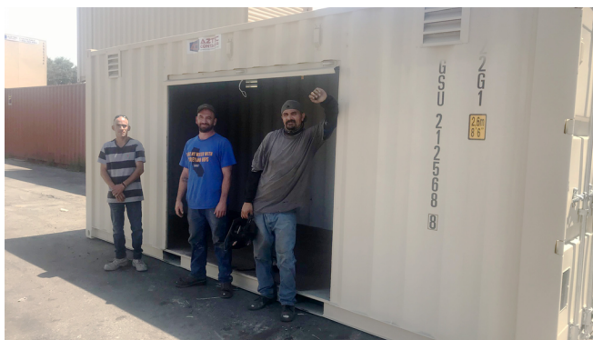
The winners of the contest

Touax Container is working on new ideas to please its buyers in 2022!